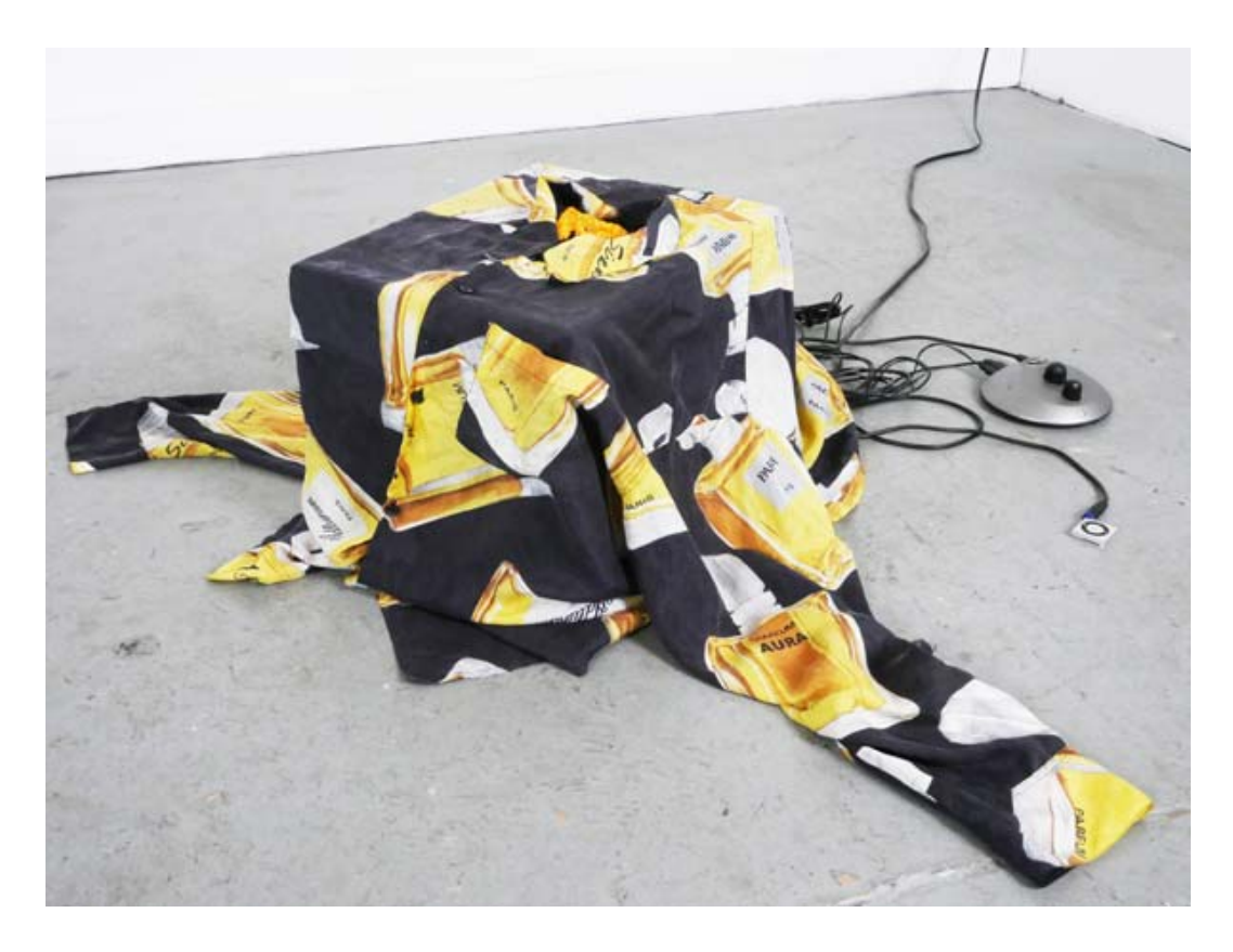
Bradford Willingham, A Subwoofer In Tweeters Clothes. August 8 – September 6, 2015 Good Children Gallery, New Orleans, LA